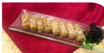
Vegetarian Trotter Aspic 野菌素肴肉

在這初夏時份，大廚特意帶來全新面貌的野菌素肴肉，以金菇及秀珍菇等代替豬蹄，加上冬菇、竹蔗、茅根、馬蹄、紅蘿蔔等煮成素上湯，既清爽又健康。如果想細味更多健康素食，就千萬不要錯過4至5月的佛誕素食精選！